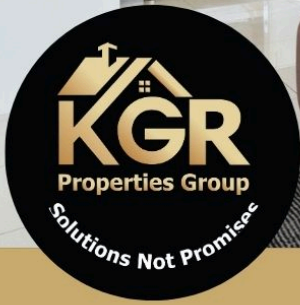
HOUSE & LAND PACKAGE - PALLARA